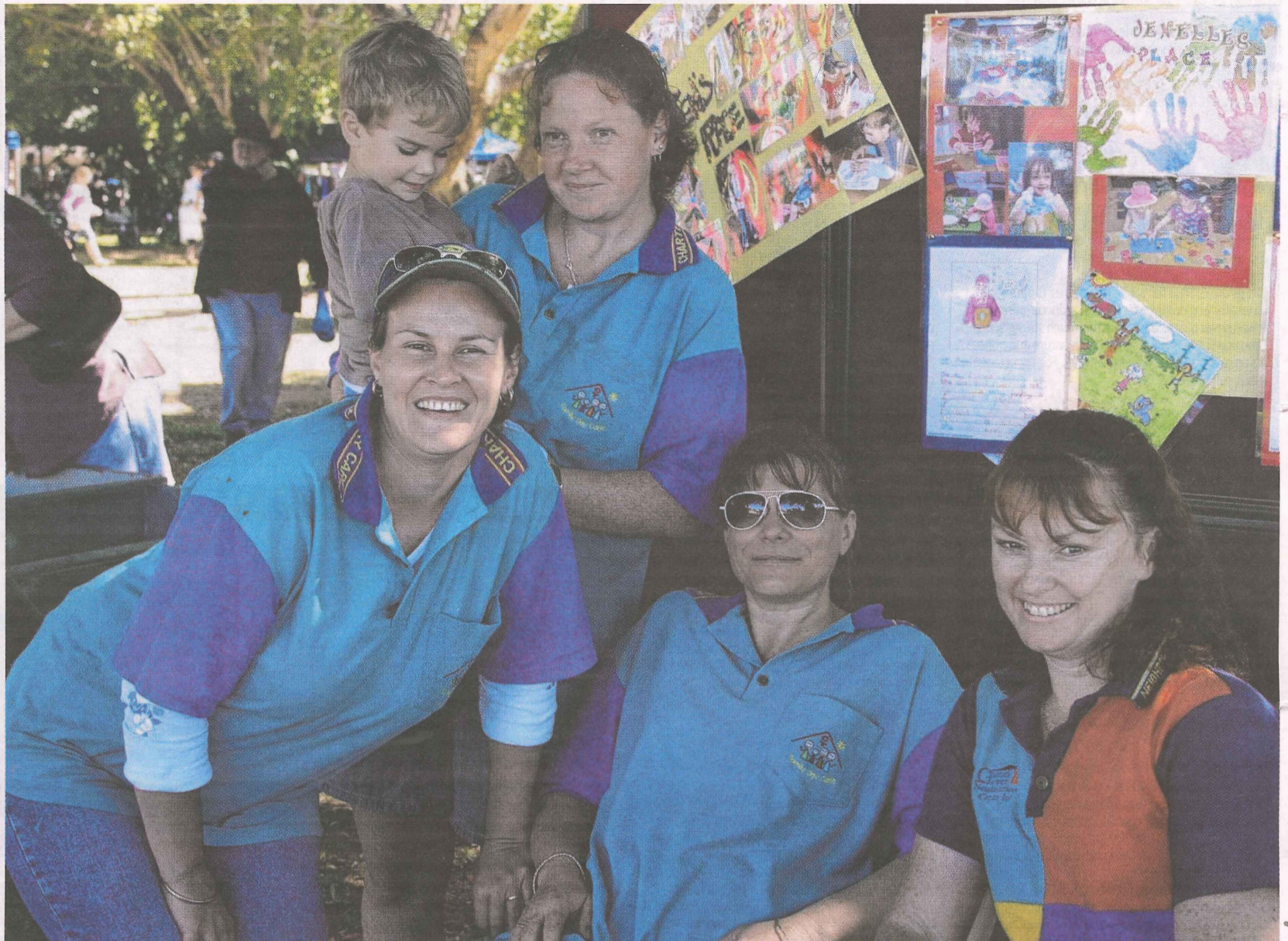
The Community Day has, since its inception in 1998, been all about bringing the people and organisations of Charters Towers together.